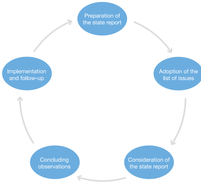
Fig 1: The stages of the reporting process