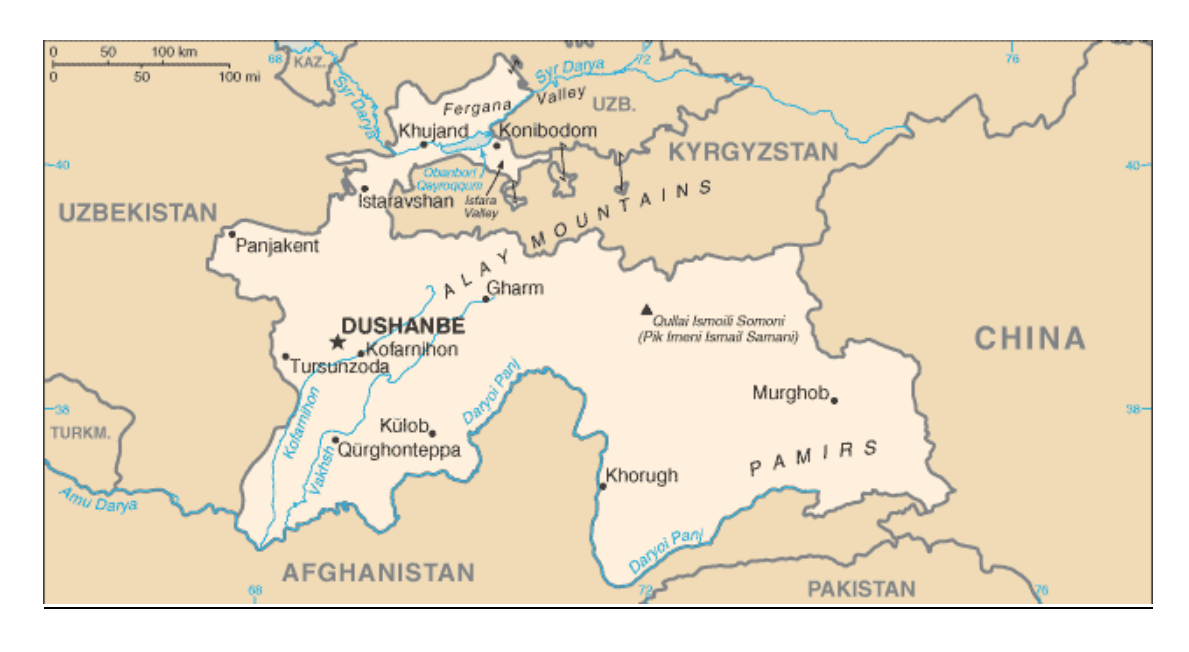
The Central Intelligence Agency The World Factbook: Tajikistan September 2006